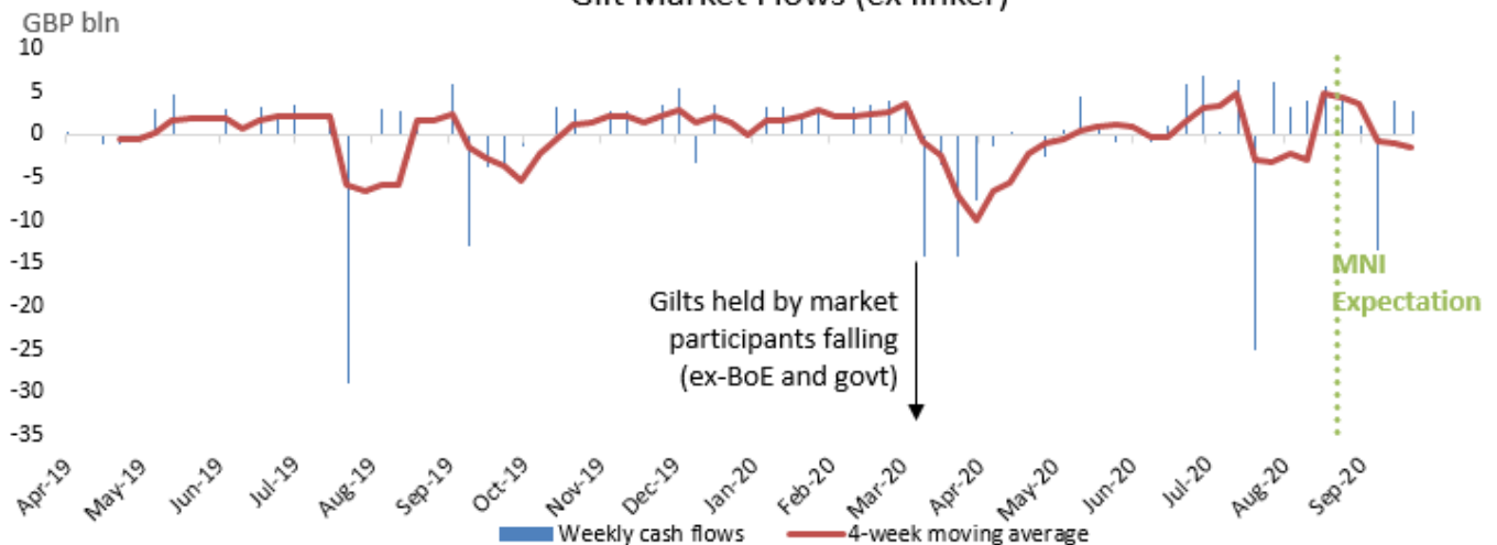
Gilt Market Flows (ex linker)